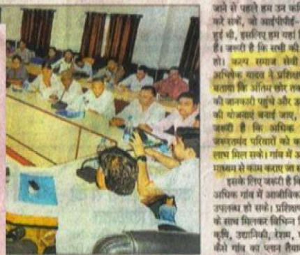
कल्प समाज सेवा संस्था द्वारा