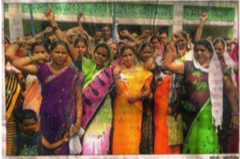
कल्प समाज सेवा संस्था द्वारा