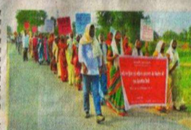
काली पट्टी लगाकर झंडा सैर करती महिलाएँ

कल्प समाज सेवा संस्था द्वारा गांवों की जरूरत के आधार पर योजनाओं को तैयार किया गया। इस बैठक का मुख्य उद्देश्य मनरेगा अंतर्गत मान परिस्थितियों पर चर्चा एवं